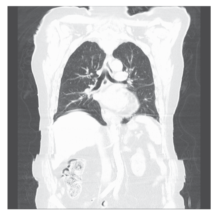
Figure 1: Computed tomography scan of chest scan (coronal plane).

We present an elderly patient who presented to A&E with stridor three times before a diagnosis of severe tracheal stenosis was made. During diagnostic CT scan,